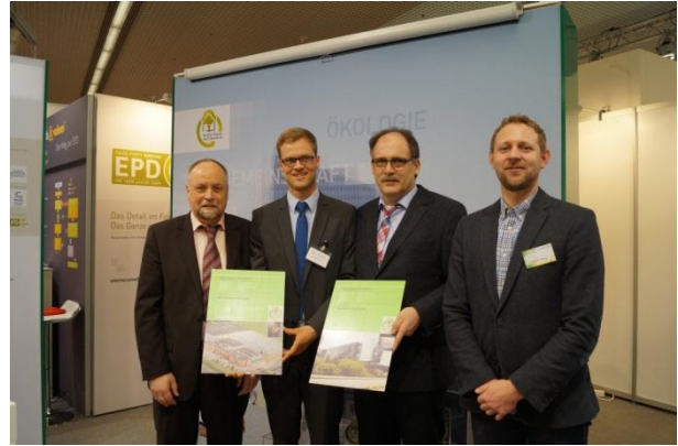
WOLFIN Bautechnik GmbH