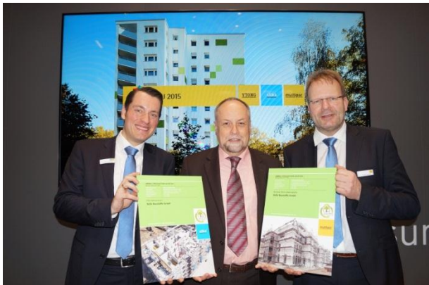
Xella Baustoffe GmbH