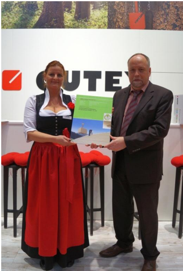
GUTEX Holzfaserplattenwerk H. Henselmann GmbH & Co. KG