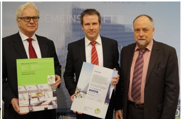
DW Systembau GmbH