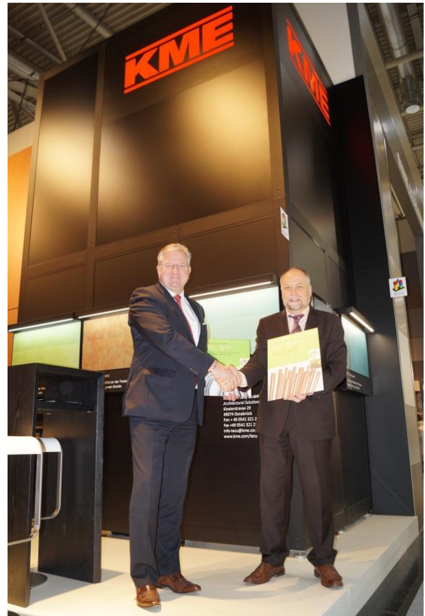
KME Germany GmbH & Co. KG