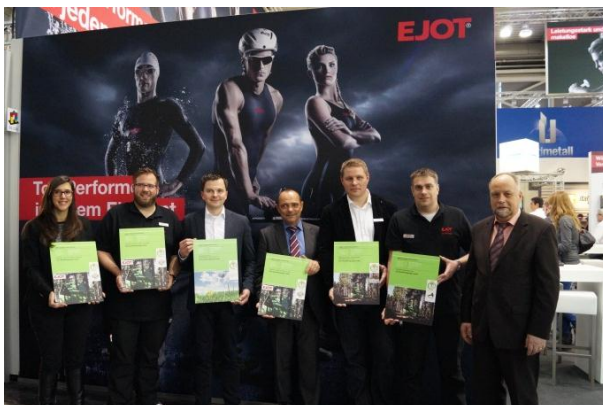
EJOT BAUFESTIGUNGEN GmbH