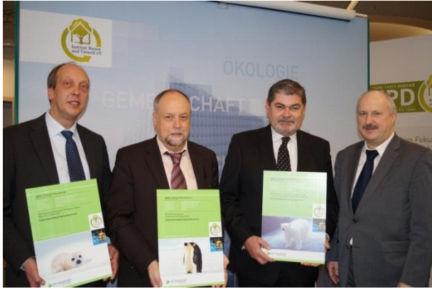
Industrieverband Hartschaum e.V.