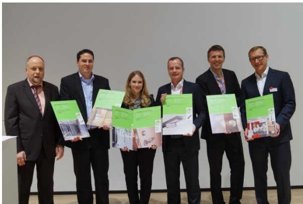
DORMA GmbH & Co. KG