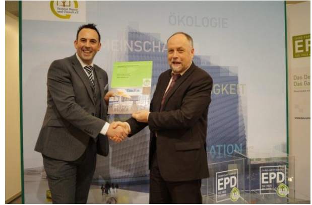
James Halstead PLC