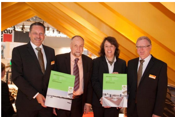
Sika Deutschland GmbH