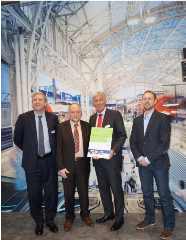
FDT Flachdach Co. KG