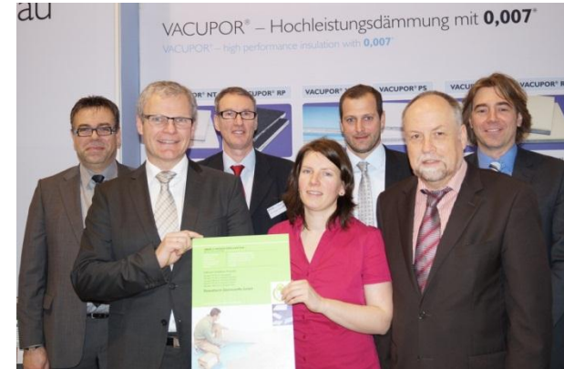
Porextherm Dämmstoffe GmbH