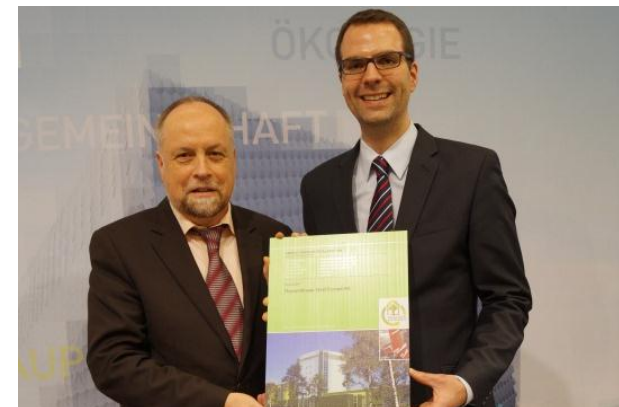
ThyssenKrupp Steel Europe AG