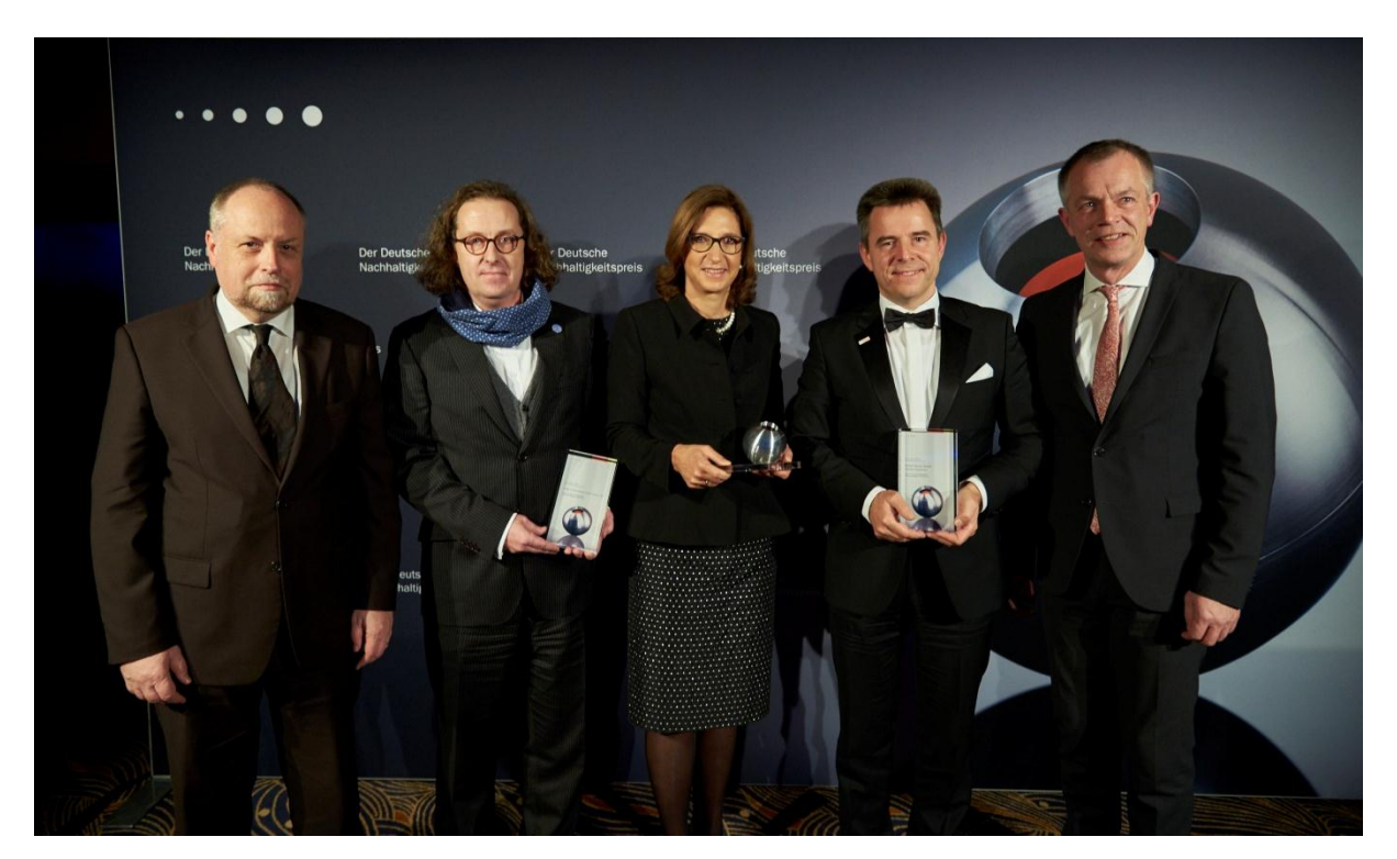
Industry IBU Grants German Sustainability Award to BASF for Resource Efficiency

On 11/27/15 in Dusseldorf as a part of the 8th German Sustainability Day, BASF received this year's special award for "Resource Efficiency", which was awarded by the Stiftung Deutscher Nachhaltigkeitspreis e.V., together with the Institut Bauen und Umwelt e.V. (IBU) as an institutional partner...more